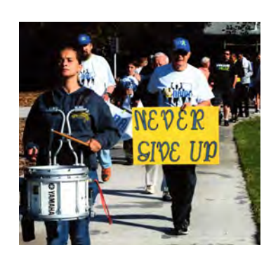
Scene from NAMI IN MOTION 2018

Why it's so important to attend: NAMI members have unique perspectives about who needs services and where funding should go. We represent voices in "the system" and out of "the system," those with County health care, those with private insurance, and those with no or limited insurance. The NAMI voice is strong and respected.