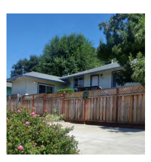
Nierika House, Concord

Any problems you do encounter, email NAMI CC at xnamicc@aol.com and we will get answers for you.