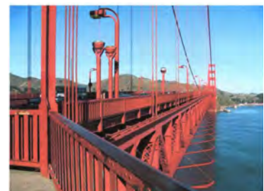
The Four Foot Railing

This presentation is an overview of the problem and what can to done about it. It includes myths and facts about suicide, demographic information, risk factors, warning signs, and how to talk to a suicidal person. It also reviews the relationship between guns and suicide, drugs and suicide, and jump sites and suicide, with an update on the status of the net on the Golden Gate Bridge. Last, and in many respects most important, is information on ending suicide—not just preventing it but ending it in this country.