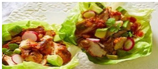
Southwest Chicken Lettuce Wraps will be made in cooking class.