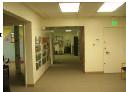
The picture on the right are their offices.