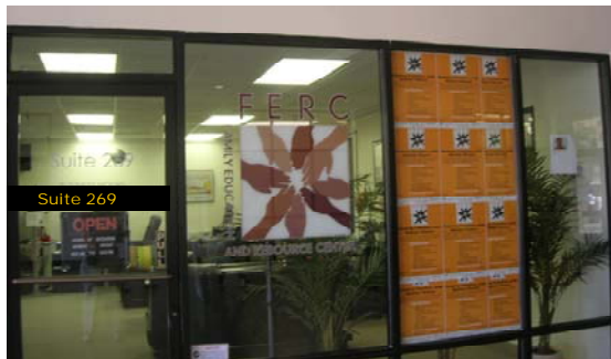
The picture on the left is the exterior.

Alameda County has been offering a Family Resource Center for nearly two years. It is located on Hegenberger Road (Oakland) in the Eastmont Mall.