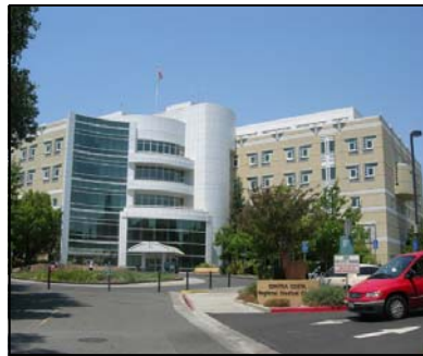
Contra Costa Regional Medical